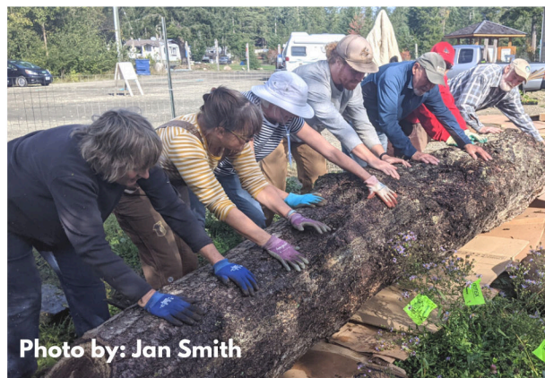
Join the team - Teamwork makes the dream work!