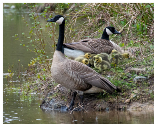
Canada Geese and Goslings

Taken on site at MARS