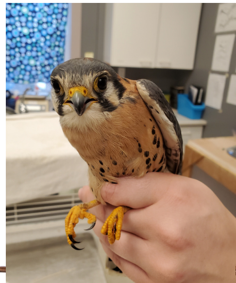
American Kestrel as a MARS patient Dec 2021