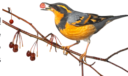
Varied Thrush with a crabapple treat!