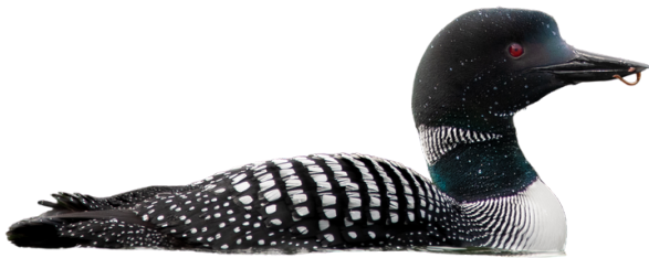
Common Loon - breeding plumage

As autumn makes way for winter, most migratory species have passed us by or have arrived for the winter. Waterfowl like Trumpeter Swans and Snow Geese have come through our hospital due to migratory exhaustion, and migratory songbirds like Golden-crowned Sparrows and Varied Thrush were admitted to our hospital because of cat attacks or window strikes. We encourage you to make a difference by keeping your cats indoors and treating your windows with anti-collision stickers. One species of bird that is usually out of range of cats and windows is one you are all likely familiar with: the Common Loon, although not all may know this bird is also migratory.