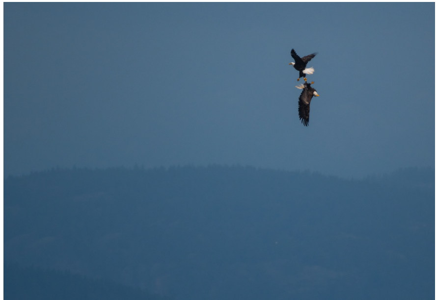
Two Bald Eagles locked together

Rounding out our patient updates is an unusual story - we received a "two for one" deal when two adult male Bald Eagles came into our hospital from Mudge Island - found locked together on the ground with blood and feathers everywhere. The two eagles were separated and the smaller of the two combatants was quickly put into the flight pen and released within weeks. Surprises are always around the corner at MARS, as the larger of the two eagles tested positive for lead poisoning. Luckily, his levels were fairly low and after a round of chelation therapy and some time in the flight pen, the second eagle was also released. Let's just hope these two keep their talons away from each other!