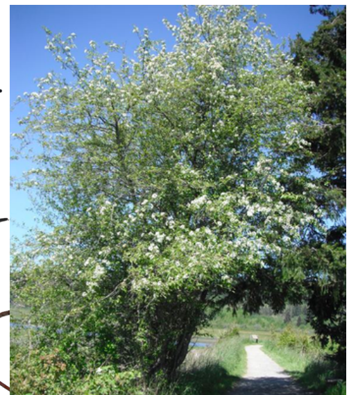
Pacific Crabapple in Spring