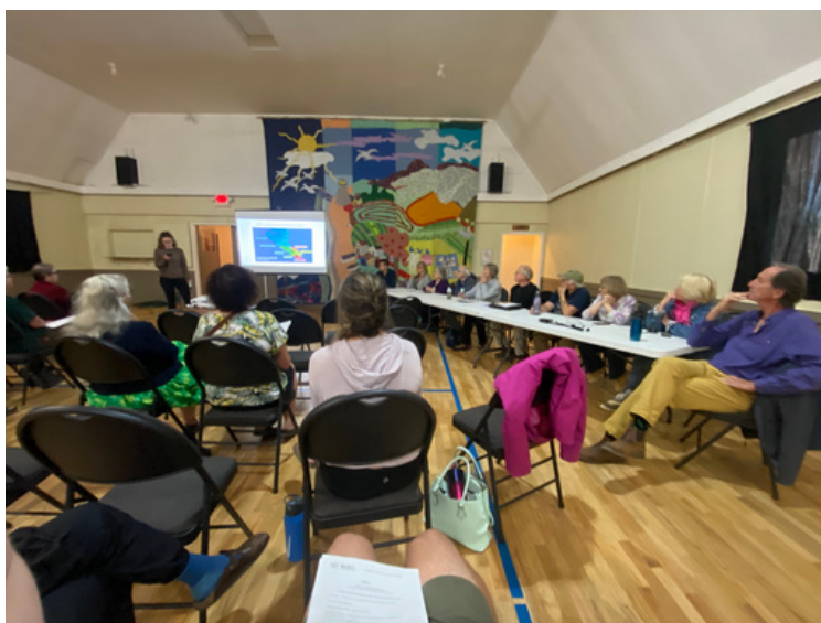
MARS AGM 2022. Thanks, Board of Directors!

We understand that not everyone wants to receive repeated reminders about MARS fundraising raffles. To give our valued members and donors a choice, we're developing a distribution list, based on MARS membership and previous raffle participants. Should you wish to limit MARS communication, please visit marswildliferescue.com/unsubscribe/ Thank you!