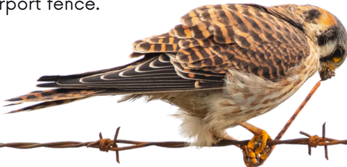
American Kestrel eating a worm at the Comox Airport

Although these fierce falcons do breed on Vancouver Island, the Comox Valley's relatively mild winters bolster the kestrels' local population, as birds from chilly northern reaches flee to our shores in the hope of finding consistent food. Good local spots to find this bird are Cox Road, Kin Beach, and along the Comox Airport fence.