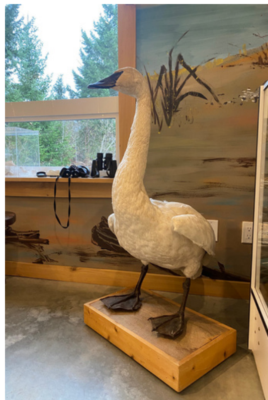
A new Trumpeter Swan taxidermy for the VC