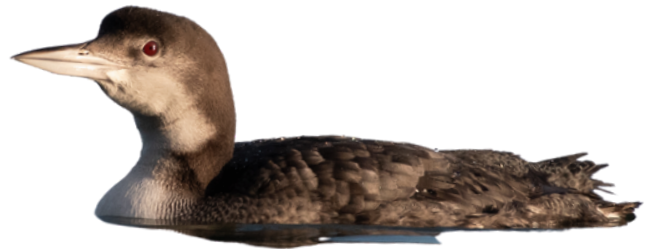
Common Loon - winter plumage

Denizens of northern lakes in the summer and residents of our coastlines in the winter, Common Loons are rarely found far from water but for one concerned person in Campbell River, that couldn't have been further from the truth! They found this poor loon right in the middle of the road - luckily before being run over! Unlike most water birds, loons need long "runways" of undisturbed water for take-off, as their backset legs built excellently for swimming don't allow them to get airborne again from a stationary position. Sometimes, in fog or other low visibility conditions, flying loons will mistake roads for bodies of water, crash land, and will be unable to take off again.