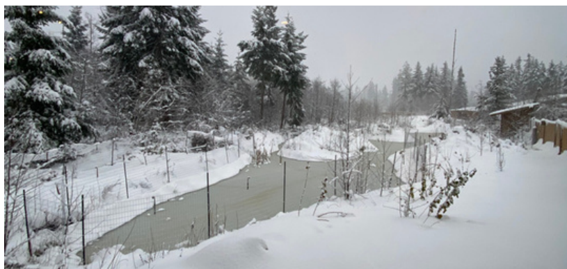
Our wetland covered in snow and ice

Looking forward to 2023, MARS has an ambitious list of projects planned. These include the continued expansion of the wildlife hospital, construction of a Fawn ICU, new mews for various birds such as Horus the Red-tailed Hawk and a 20' extension for Marlowe. Furthermore, there are also upgrades planned for the infrastructure of the hospital including access road and egress road, below-ground power and water infrastructure to the Fawn ICU and other buildings. BP2 has been awarded the contract for the construction of the hospital expansion and Fawn ICU, however, there may be opportunities for volunteers to assist in reducing costs, thus contributing to the overall goal of improving the facilities and care at the wildlife hospital. Thanks again to the hard work of our dedicated volunteer Construction Committee